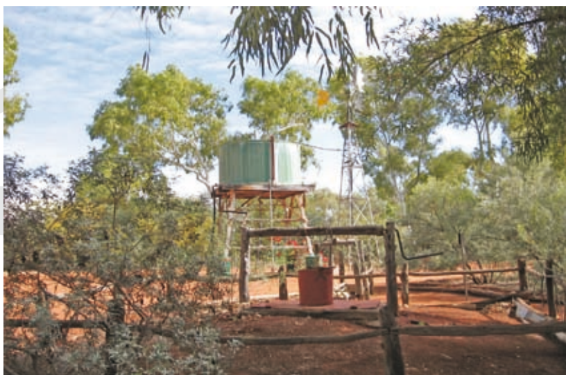
The water works at Murchison Roadhouse